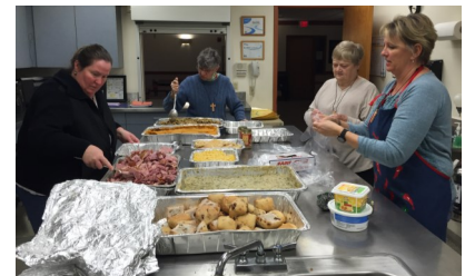
Making lunch at My Brother's Keeper in Irvington