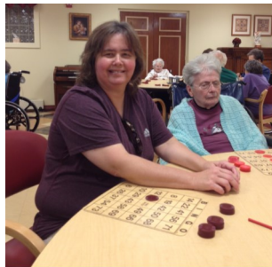
We shared the day with new friends at St. Joseph's Nursing Home in Catonsville.