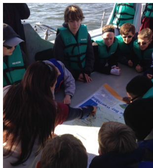
Gr 7 Chesapeake Bay Field Trip Lucky for them it was unseasonably mild in November