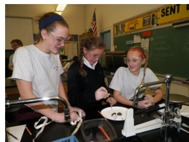
Gr 7 Dissection lab. The girls are discovering what an owl eats through careful examination of the owl pellets.