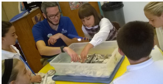
AquaPartners Classroom Lab in Gr 4

On a monthly basis, we have an award ceremony for the students who exemplify the "Value of the Month." Two students from each homeroom are chosen and honored at our prayer service. Students receive a lion paw dog tag to wear and/or display on their backpack. The values include: respect, honesty, responsibility, self-control, hard work, concern for others, tolerance, cooperation, fairness and self-knowledge.