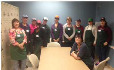
Several spent the day at Our Daily Bread in Baltimore completing a multitude of tasks for the clients of the soup kitchen.

We're sorry to report that pictures were not allowed at The Little Sisters of the Poor, but the faculty who represented us there had a wonderful day and were uplifted by witnessing the special care given to the elderly residents.