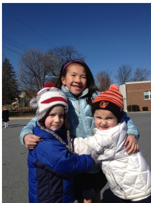
February recess! It's been so cold, but we try to go out as often as we can!