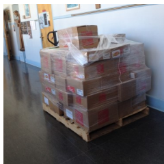
This is what a pallet of books looks like before it is treasured by a student!

The faculty and students of St. Mark thank our very kind and generous donors for their gifts that enabled us to purchase a new reading program for Grades 3 –5. The shipment of 55 boxes arrived in the summer and the books are now enjoying the warmth and admiration of our primary grade students and teachers! Thank you from the bottom of our hearts for answering our call to help provide the updated reading materials for this school year! Our next goal is to replace our science textbooks to align with the new science curriculum we will be implementing.